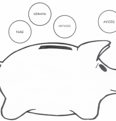
Figure 2. Making relationship withdrawals